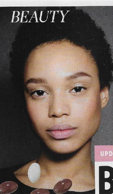
Derek Lam AW16